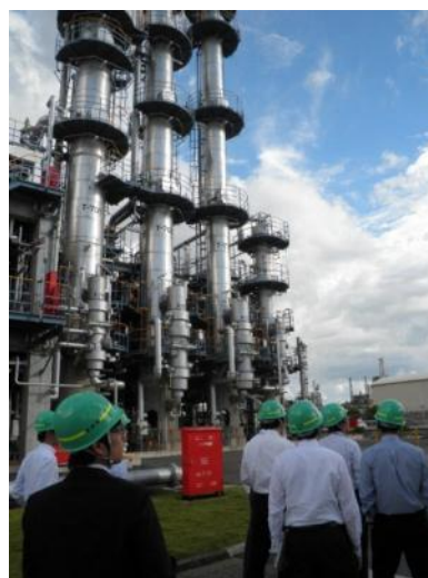
Plant tour for institutional investors